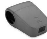
Grill-Out™ Handle Light LED lights illuminate the cooking surface of your Weber making cooking even easier. 7516 RRP $59.95