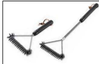
3 Sided Grill Brushes Makes it easy to get between the grill bars and other difficult places. Small 6494 RRP $21.95 Large 6493 RRP $26.95