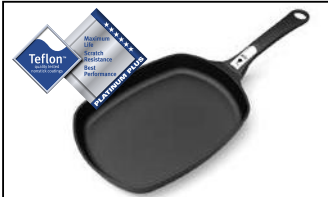
Weber Ware Frying Pan Large Platinum Teflon coated easy to clean surface with a detachable handle. 17725 RRP $89.95