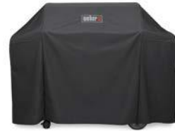
Full Length Covers Genesis II 3 Burner 7130 RRP $134.95 Genesis II 4 Burner 7131 RRP $149.95