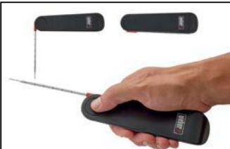
Snapcheck Grilling Thermometer Super-fast and accurate to within 1°C. The Snapcheck thermometer is the ultimate instant thermometer. 6752 RRP $149.95