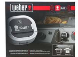
iGrill 3 Monitors food and notifies you on your smart device once it is cooked to your liking. 7204 RRP $179.95