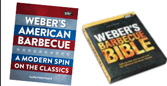
Cookbooks Weber's American Barbecue 991166 RRP $39.95 Weber's Barbecue Bible 991165 RRP $34.95